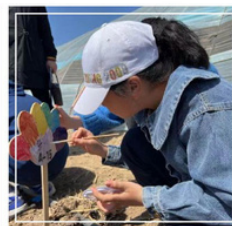
呼应教育部劳动课程新标准，在北京上海推出“认养小菜园”产品，体验种植采摘 Launching "Adopt Veggie Gardens" product to get close to modern farming