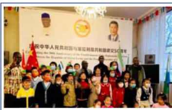
北京萌娃走近赞比亚使馆，跟领事们零距离交流，学习外交礼仪 Visiting the Zambian Embassy to learn diplomatic etiquettes and culture