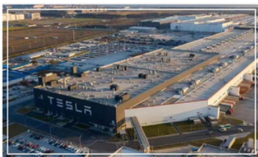
亲临上海制造业超级IP特斯拉品牌，了解新能源汽车的发展动态 Touring Tesla's superfactory to learn new trends in the new energy vehicle industry