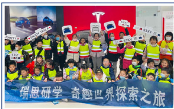
走近一票难求的“网红天文馆”探索宇宙奥秘 Visiting the popular planetarium to explore the secrets of the universe

Century Tours has developed over 40 different types of study tours and camps that cover arts and culture, professional skills, survival challenges and more. Beside, Century Tours has also reached agreements with high-quality venues in Beijing and Shanghai such as resorts, camps, farms and villas to provide venue solutions for the activities.